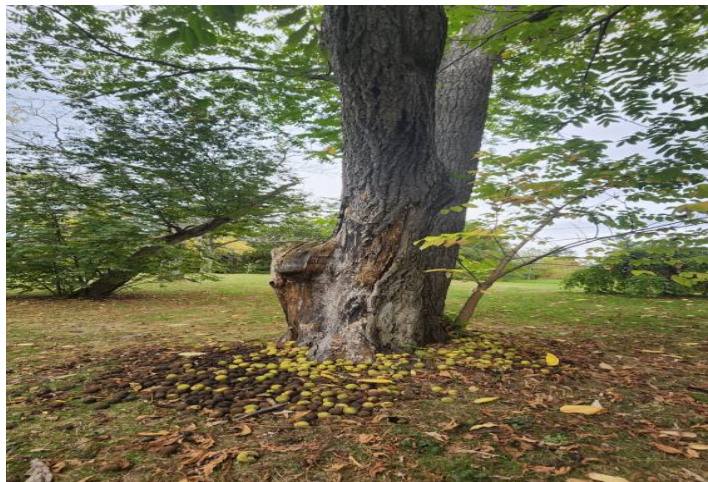
Seeds of unidentified tree in Ottawa, Canada gathered by squirrel/chipmunk for food