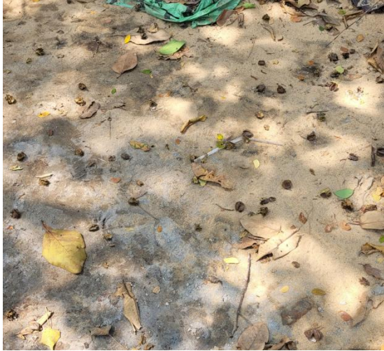
Seeds of Terminalia arjuna