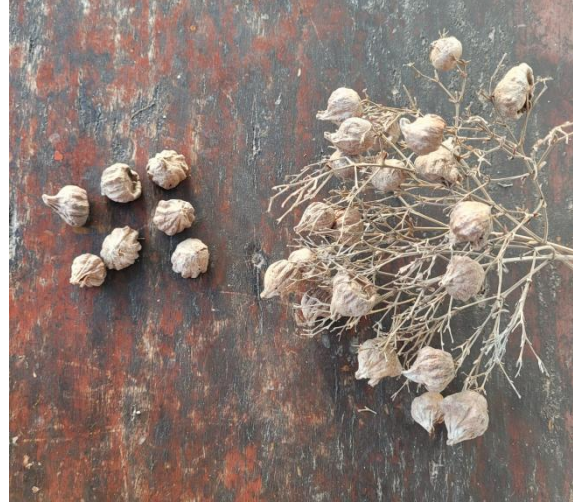
Seeds of Tectona grandis